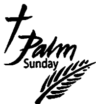
Children's Procession of Palms